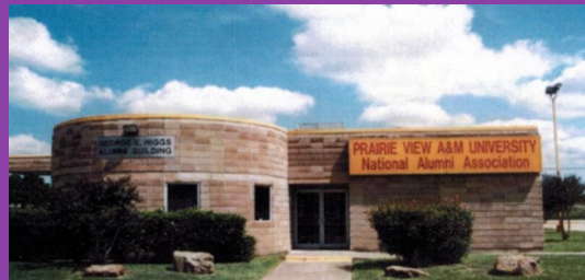
Prairie View A&M University National Alumni Association - Headquarters