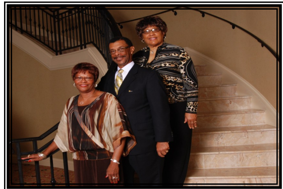
2010 Convention Alumni Dance photo

If you have additional questions about the Convention please contact the National Alumni Association Office at: 936-857-5817, Monday-Friday between 9:00 am-5:00 pm.