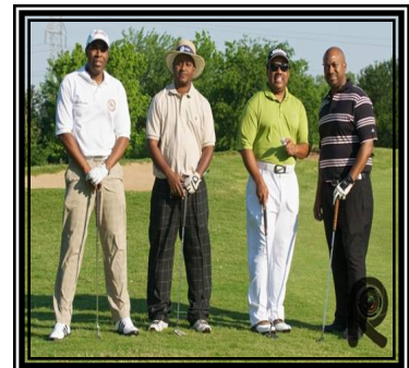
Ft. Worth Golf Tournament 2010