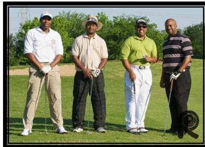
Ft. Worth Chapter Golf Tournament 2011