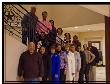
Ft. Worth Convention Committee 2012